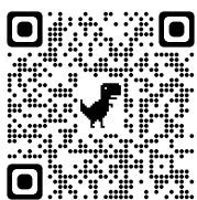
School Resources Padlet

The educational philosophy at Highland is based upon the fact that children are naturally inquisitive and excited by learning. Our goal is to keep that inquisitiveness alive. Highland Free School wants to create an environment that stimulates students to explore, create and learn at their own pace. To enable children to individually explore the potential of a situation or learning experience, children will be given the chance to develop independence, self-confidence and self-discipline by making choices and taking responsibility for those choices.