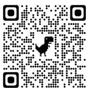
School Resources Padlet

The educational philosophy at Highland is based upon the fact that children are naturally inquisitive and excited by learning. Our goal is to keep that inquisitiveness alive. Highland Free School wants to create an environment that stimulates students to explore, create and learn at their own pace. To enable children to individually explore the potential of a situation or learning experience, children will be given the chance to develop independence, self-confidence and self-discipline by making choices and taking responsibility for those choices.